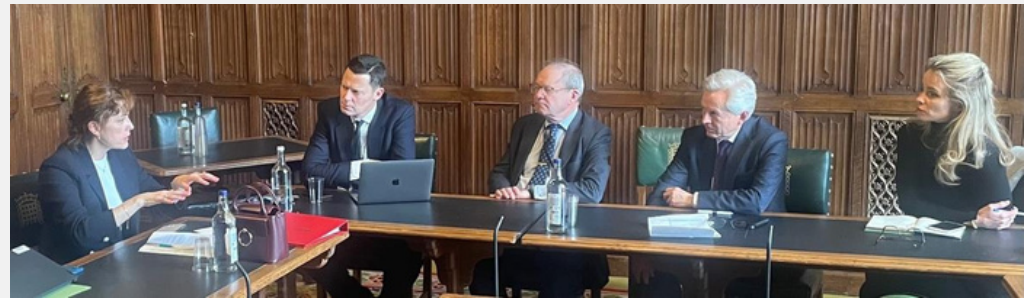
Then-Health Secretary Victoria Atkins meeting with Conservative MPs from Gloucestershire following a meeting with local Rebuild GP spokespeople.